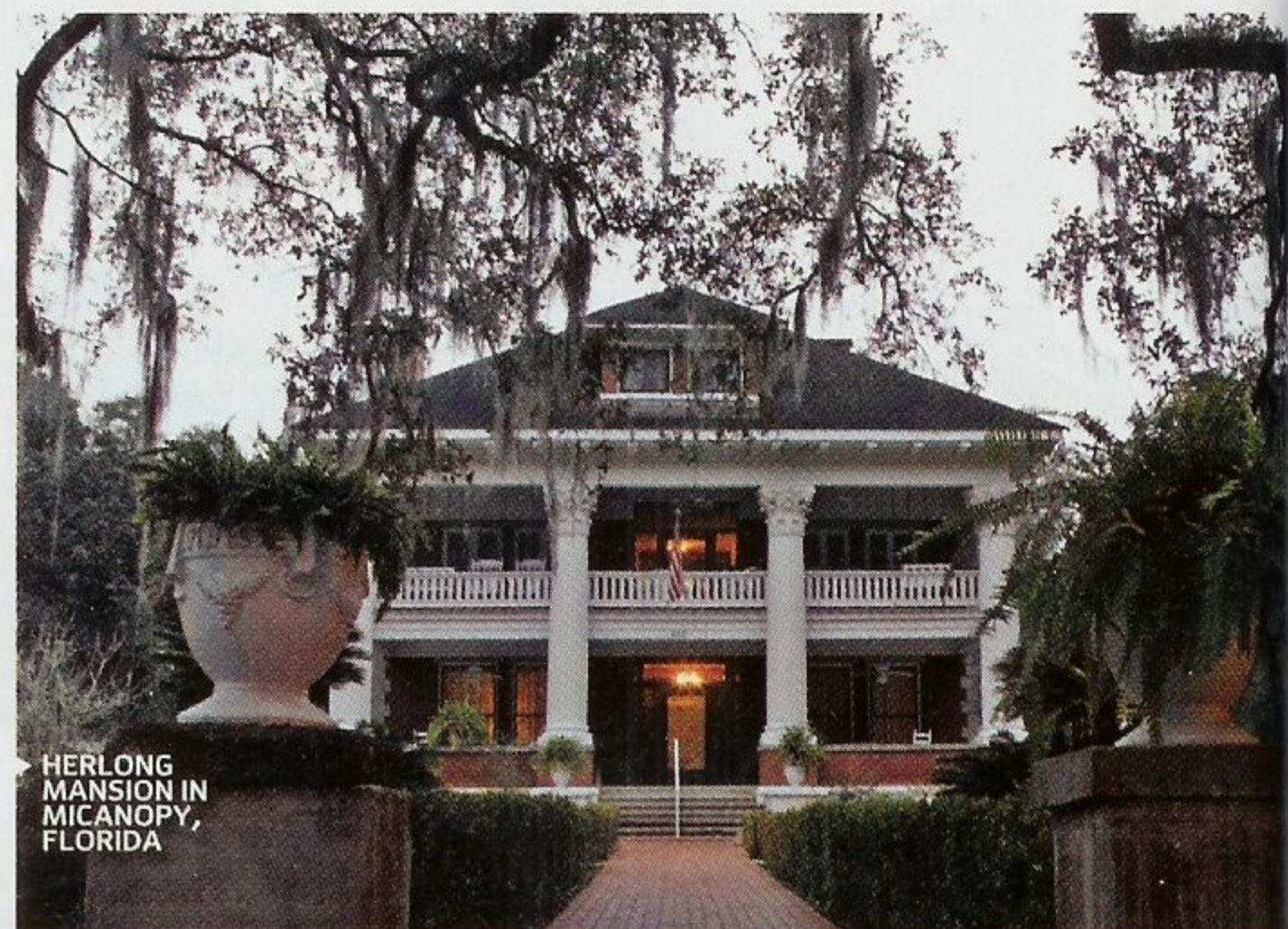
HERLONG MANSION IN MICANOPY, FLORIDA

EACH DAY MILLIONS OF GALLONS of liquid crystal are released from the natural springs of Manatee Springs State Park (352-493-6072 or floridastateparks.org/manateesprings ) in northern Florida. Locals call them boils, and here's the best way to enjoy them: Look up at the canopy of cypress and hickory, cast your body backward, and just float on the roiling surface of a turquoise cauldron. It's an hour's drive from Manatee to Micanopy ( welcometo.micanopy.com ), the first town settled after Spain's territorial cession in 1821. Though only 12 miles south of the Gainesville airport, the town remains a time-warped aggregate of slanting antiques shops, museums, and the literary outpost O. Brisky Books (352-466-3910). Check your bags at the oak-shrouded Herlong Mansion (800-437-5664 or herlong.com ; $129-$189), built in 1845, which has 12 balconied suites and cottages that exhibit admirable doily restraint. Walk to the Pearl Country Store (352-466-4052), where at lunch ribs and greens fly across the counter, then drive ten minutes to Paynes Prairie State Park (352-466-3397 or floridastateparks.org/paynesprairie ) to see alligators and swamp chickens. Later you can visit Cross Creek, home of Marjorie Kinnan Rawlings when she wrote The Yearling , then sway to live blues and dine on cooter and fried alligator at the Yearling Restaurant (352-466-3999).